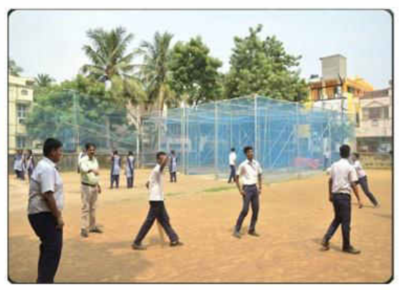
SCHOOL PLAY GROUND