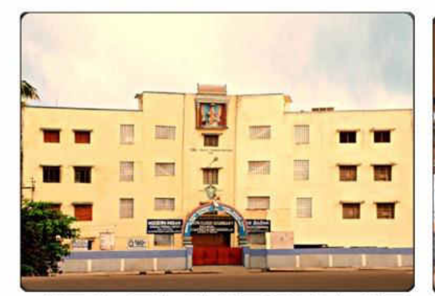
GEO-TAGGE IMAGE SCHOOL LIBRARIES